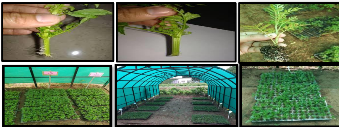
Overview of experiment

Note: Cuttings of marigold are to be planted into the plug tray after dipping them in 150 mg/L IBA solution for 10 min. under 50% green shade net condition.