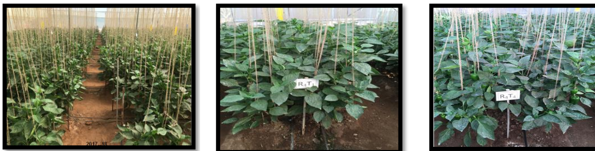
Overview of experiment

ventilated polyhouse are advised to transplant capsicum in paired row system with spacing of 45 – 85 – 45 cm × 30 cm in raised bed for getting higher yield and net return. The bed should be prepared 40 cm apart with 90 cm base width, 75 cm top width and 45 cm height.